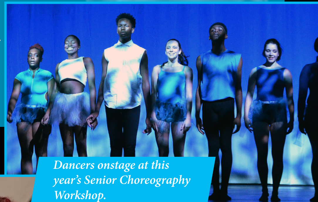
Dancers onstage at this year's Senior Choreography Workshop.

With names like "Grit," "Phenomenal Women," and "Amour," each piece was of its choreographer's creation, inspired by their passion for dance and their unique sense of the art. Only these dancers could have choreographed these pieces.