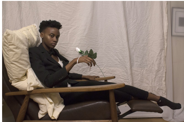
Miranda Wood, Olympia , 2018 Archival pigment print